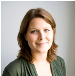
Eva Primavesi Public Relations

I am happy to assist you! For further inquiries please contact me: